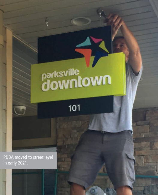
PDBA moved to street level in early 2021.