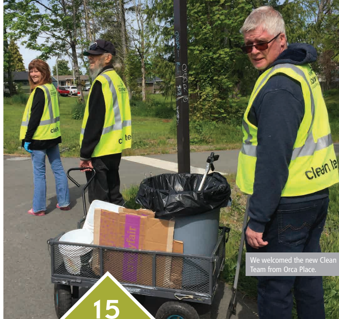
We welcomed the new Clean Team from Orca Place.